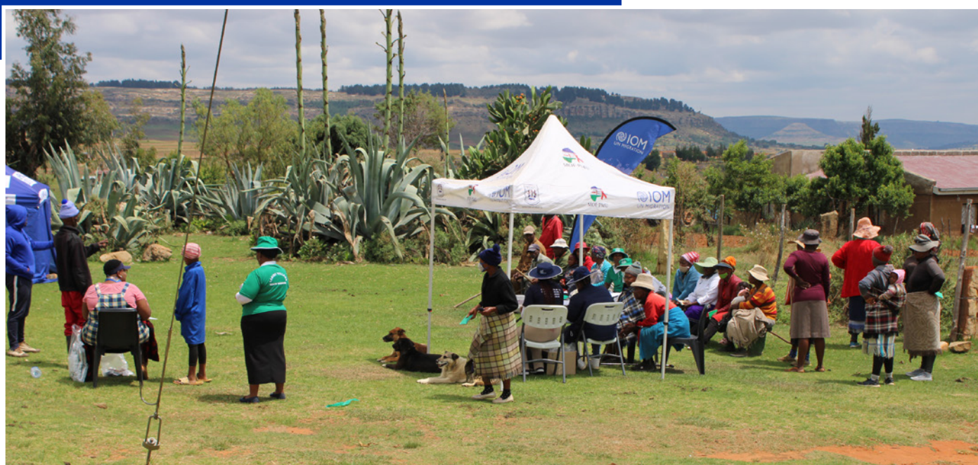
Migration affected community of Ha-Mokati receiving health services.

With a focus on HIV, TB, COVID-19, and SRHR, IOM contacted a supportive supervision visit to oversee the implementation of outreach activities conducted by the Migrant Worker Association (IOM implementing partner) from 26 to 29 October 2023.