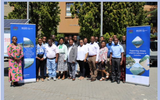
Member of the NCCC Lesotho.

On 5 October 2023, the National Climate Change Committee (NCCC) met in Maseru to validate the methodology to undertake a country-wide assessment of migration and its linkages with the environment and climate change in Lesotho.