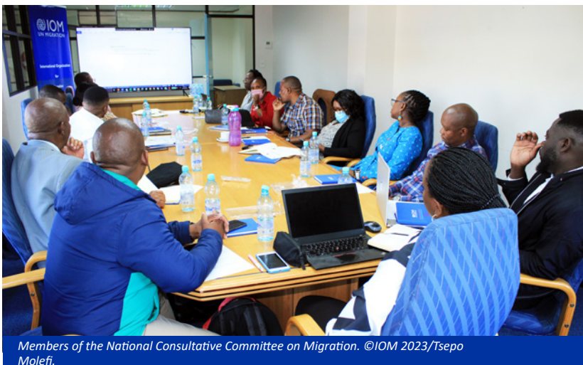
Members of the National Consultative Committee on Migration.

The NCC is an inter-ministerial and multi-sectoral body that has an advisory role to the Government of Lesotho (GoL) in all aspects of migration issues. It comprises Government Ministries and Non-Governmental Organizations (NGOs) that have a role in migration. The Ministry of Local Government, Chieftainship, Home Affairs and Police chairs the committee. It has been playing a critical role in policy development, policy advocacy on migration projects, and program implementation in Lesotho.