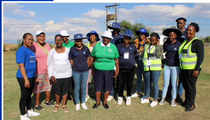
Health service provider's team at migration affected village - Ha-Mathamane.