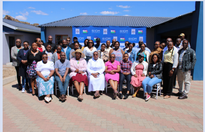
Butha-Buthe DHMT, health Partners and stakeholders.

As part of strengthening migrant-friendly service delivery to improve retention in care by addressing the specific needs of migrants and mobile populations, IOM held dialogues with District Health Management Teams (DHMT), district health service providers, and other stakeholders in Quthing and Mohale's-hoek from 06- 08 November 2023. The objective of the district dialogues was to reflect on migrant-friendly services provided during outreaches to migration-affected communities in both districts. Dialogues also provided platforms for partners working in close collaboration with health facilities recording high default rates of patients on anti-retroviral treatment (ART) to share challenges and solutions linked to migration.