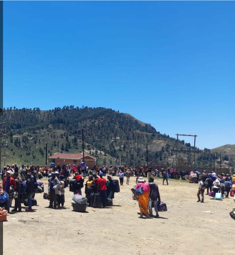
Influx of Basotho migrants coming back home through Qacha's Nek Border for Christmas holidays.

Having a brief discussion with some of the migrant beneficiaries on health services provision at borders, they said the initiative had helped them since the Christmas holidays are busy, they might not have enough time to go to health facilities for services as they are also far from their homes.