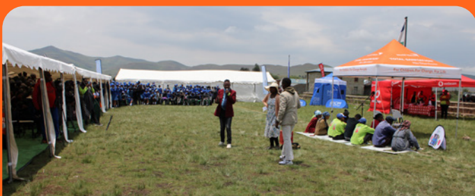
GIRL 4ce group playing drama on GBV.