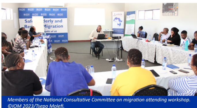
Members of the National Consultative Committee on migration attending workshop.

The workshop brought together technical officials from academia, Government Ministries, and NGOs to foster dialogue and collectively reflect upon enhancing migration management in Lesotho. The workshop concluded with the formulation of actionable recommendations to strengthen programmatic and policy responses toward addressing emerging migration issues.