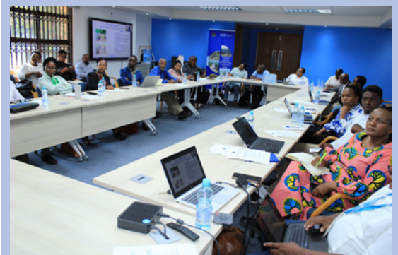
Member of the NCCC Lesotho attending the validation meeting.

This assessment aims to provide the empirical evidence and basis for developing a national Migration, Environment, and Climate Change (MECC) strategy. The strategy will contribute to Lesotho's commitment to the National Climate Change Policy and other climate action plans and policies in the country. The meeting was attended by 20 participants from relevant ministries and NGOs. It was supported by the IOM Develop Fund (IDF).