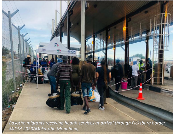
Basotho migrants receiving health services at arrival through Ficksburg border.