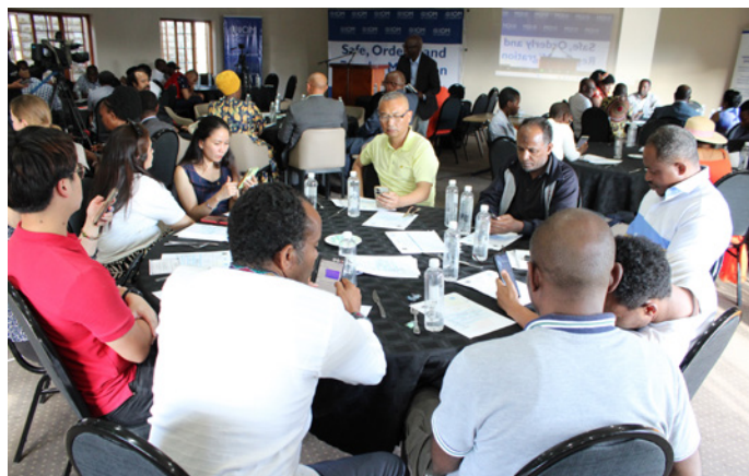
International Community attending the commemoration of IMD