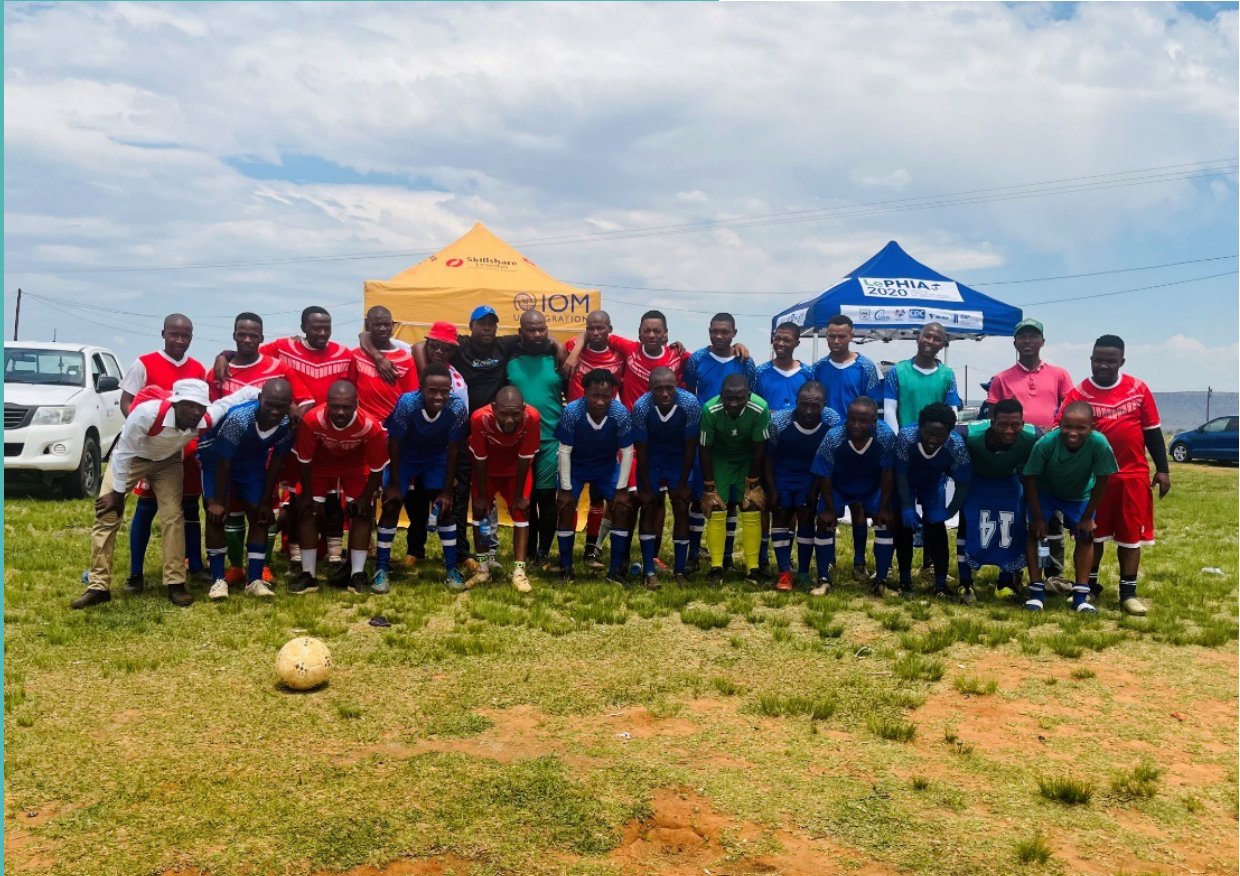
Maputsoe soccer teams joining the tournament.

Multi-sporting activities were considered one of the best mobilization strategies to encourage people to take up Sexual Reproductive Health services. In October, IOM supported three soccer tournaments in Maputsoe, Leribe District, where 12 teams from migration-affected communities were invited.