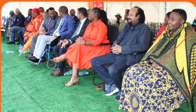
VIP guests during the launch of 16 days of activism against GBV.

IOM joined the GoL, United Nations (UN) Agencies, Civil Society Organizations, and the Semonkong Community to launch the 16 days of activism against Gender-Based Violence (GBV) in Semonkong on 24 November 2023. Due to the Maletsunyane Braai Festival in Semonkong, which attracted sufficient local and regional audience, the place became a unique platform to raise awareness, advocate for change, and promote critical issues that affect Basotho, including GBV, human rights, nutrition, and climate change in line with the Sustainable Development Goals (SDGs). The event was honoured by the Minister of Gender, Youth, and Social Development, Honourable Pitso Lesaoana.