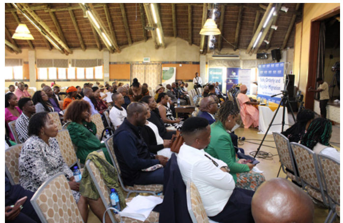
Participants during Basotho diaspora homecoming event at Thaba-Bosiu Cultural Village.

"While the movement of people into the diaspora used to be viewed with trepidation and was associated with loss and exile, it is now understood to have several benefits, including influencing national economies through remittances to family members in their home countries, foreign direct investment, trade facilitation and transfer of knowledge and skills," she said. "It is against this background that we have decided to forge a new partnership trajectory with our diaspora. I am confident that the benefits of this new course will be realized soon."