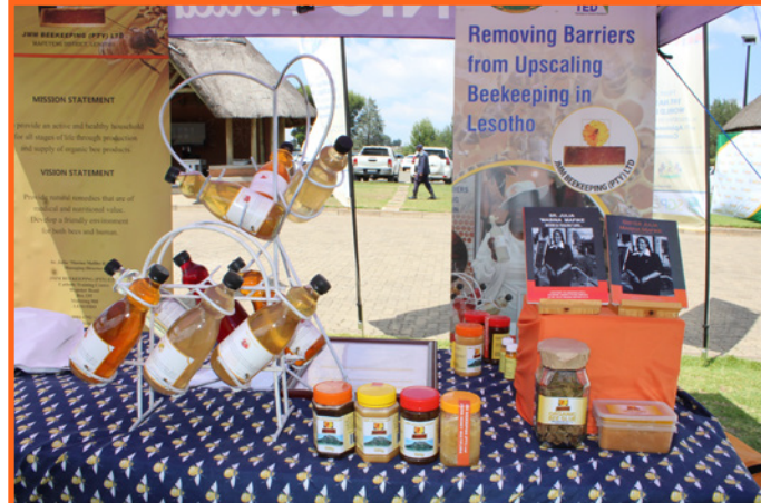
Small Basotho businesses exhibiting their products.