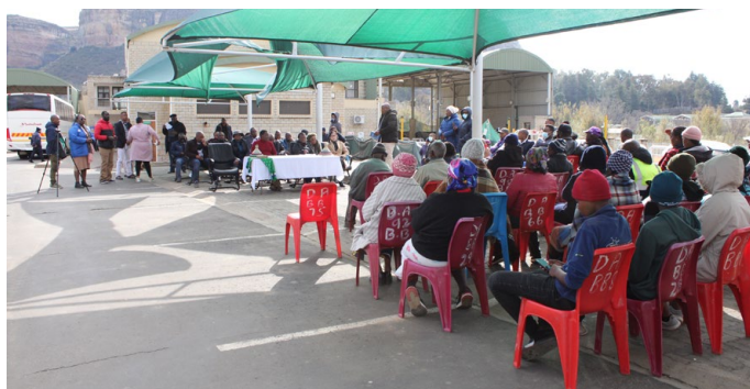
Parliamentarians having dialogue with Caledonspoort Border community.