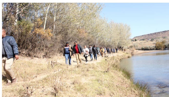
Parliamentarians exploring Tele Border.

This activity came as a result of the workshop for Members of Parliament (MPs), which was held in Leribe on 4 to 6 April 2023, aimed to increase their knowledge to enhance migration governance in Lesotho and to effectively respond to various migration challenges Lesotho face. This time, some 25 MPs visited three borders to observe the situation at borders and hear from the border officials and the communities about the migration issues.