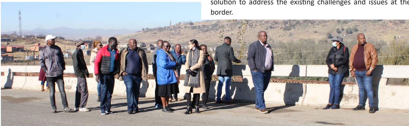
Parliamentarians on Maputsoe Bridge

approach so that the laws can actually emanate from communities who are the primary beneficiaries of those laws.” He said, he would take the initiative to reach out to their counterparts in South Africa so that they can be together in similar nature of the visit to jointly understand the situation at borders, so that they can both from Lesotho and South Africa, advocate for the laws and finances that will bring practical solution to address the existing challenges and issues at the border.