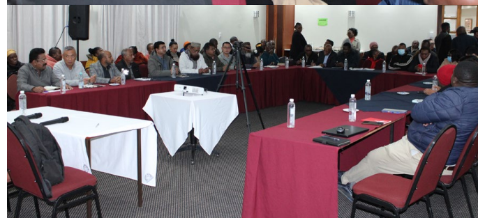
International migrants representatives