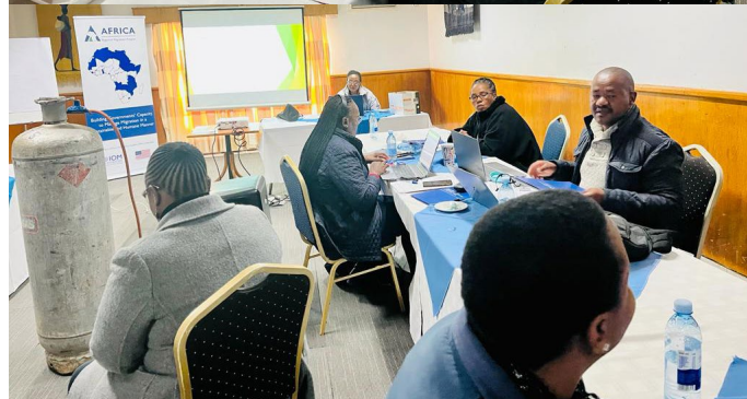
Participants in the workshop