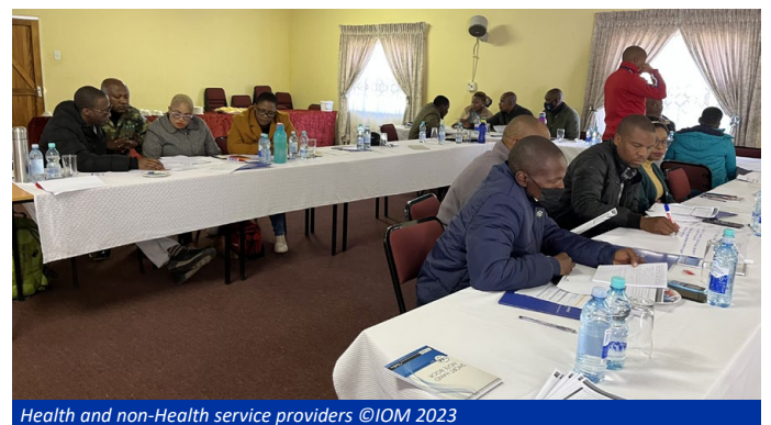
Health and non-Health service providers

Skillshare. Among activities conducted during training was a scenario in which trainees were taken through, and requested to identify the SRHR services needed by the different characters. Other training topics included maternal health, family planning, community-based health service, pre-exposure prophylaxis and SGBV. Participants were encouraged to support the project by encouraging the communities to seek care early so that interventions could be undertaken and implemented on time.