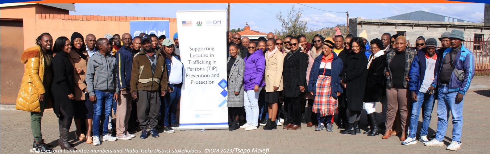
Multi-Sectoral Committee members and Thaba-Tseka District stakeholders.