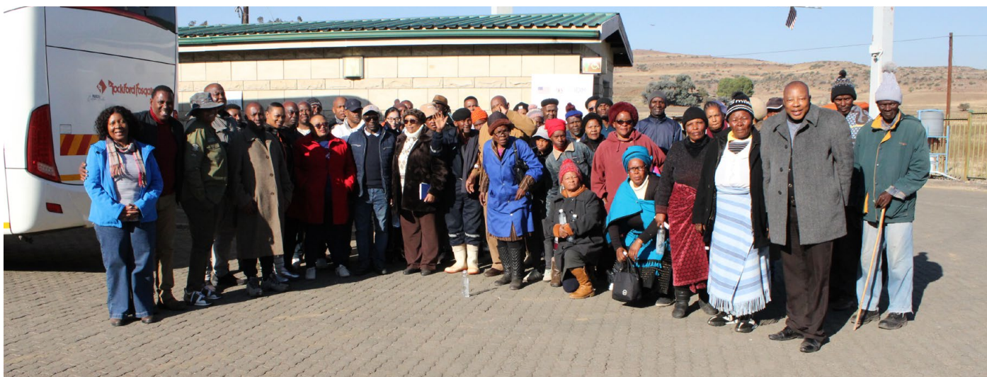
Parliamentarians and Tele Border community at Tele Border

One of the community members said one of the challenges they face is the limited number of thirty (30) days they are given to stay in South Africa, which makes it difficult for them to come home as most of them work very far from the borders, and their