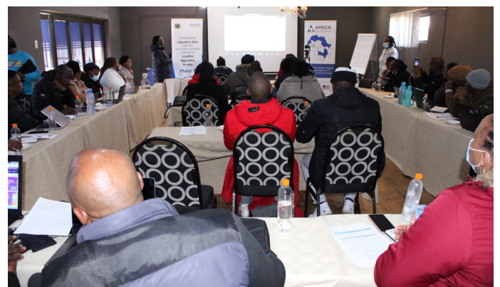
Participants in the workshop

opener and will help us align our local definitions with the international definitions. The other concept we learned that will impact our work is 'missing and deaths of migrants'. We have seen on the news bulletins that migrants die in large numbers but were unaware that IOM has a system of tracing the deaths and assisting affected families. Since we do also register deaths, we will be mindful to identify whether deaths are related to migration or not," he said.