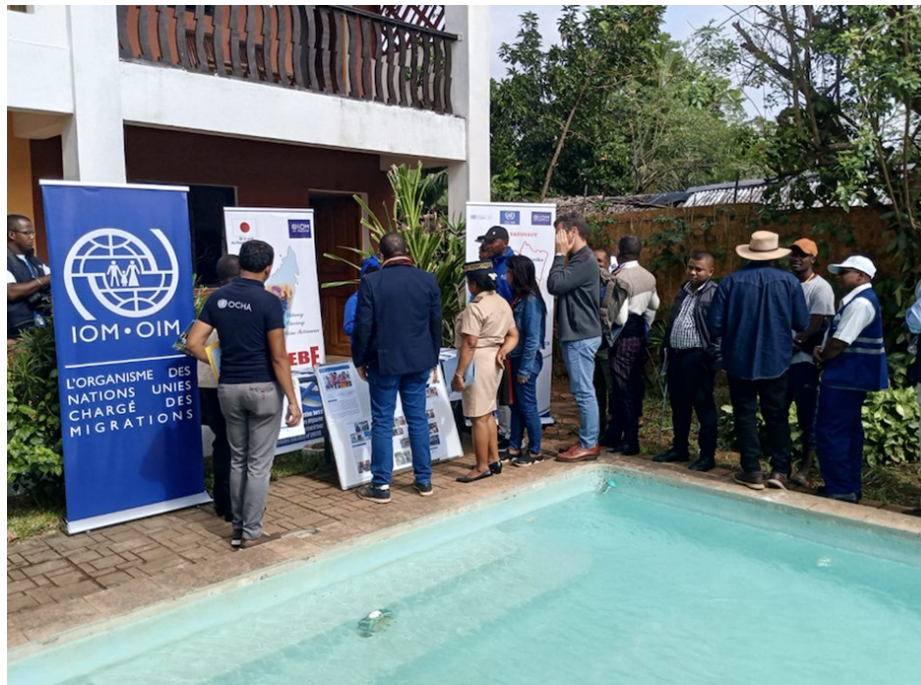
Government authorities, UN agencies and participants visiting the IOM stand during the ceremony, eager to learn more about IOM's projects and activities in southeast Madagascar

As such, IOM received USD 700,000, which will be used to assist 4,642 households (equivalent to 20,889 internally displaced persons) through the implementation of a "cash-for-shelter" program. This cash transfer will help the most affected and vulnerable populations, which have seen their houses partially or completely damaged and/or destroyed, to rehabilitate their shelters. Three community centers damaged by cyclone Freddy will also be rehabilitated in the town of Mananjary.