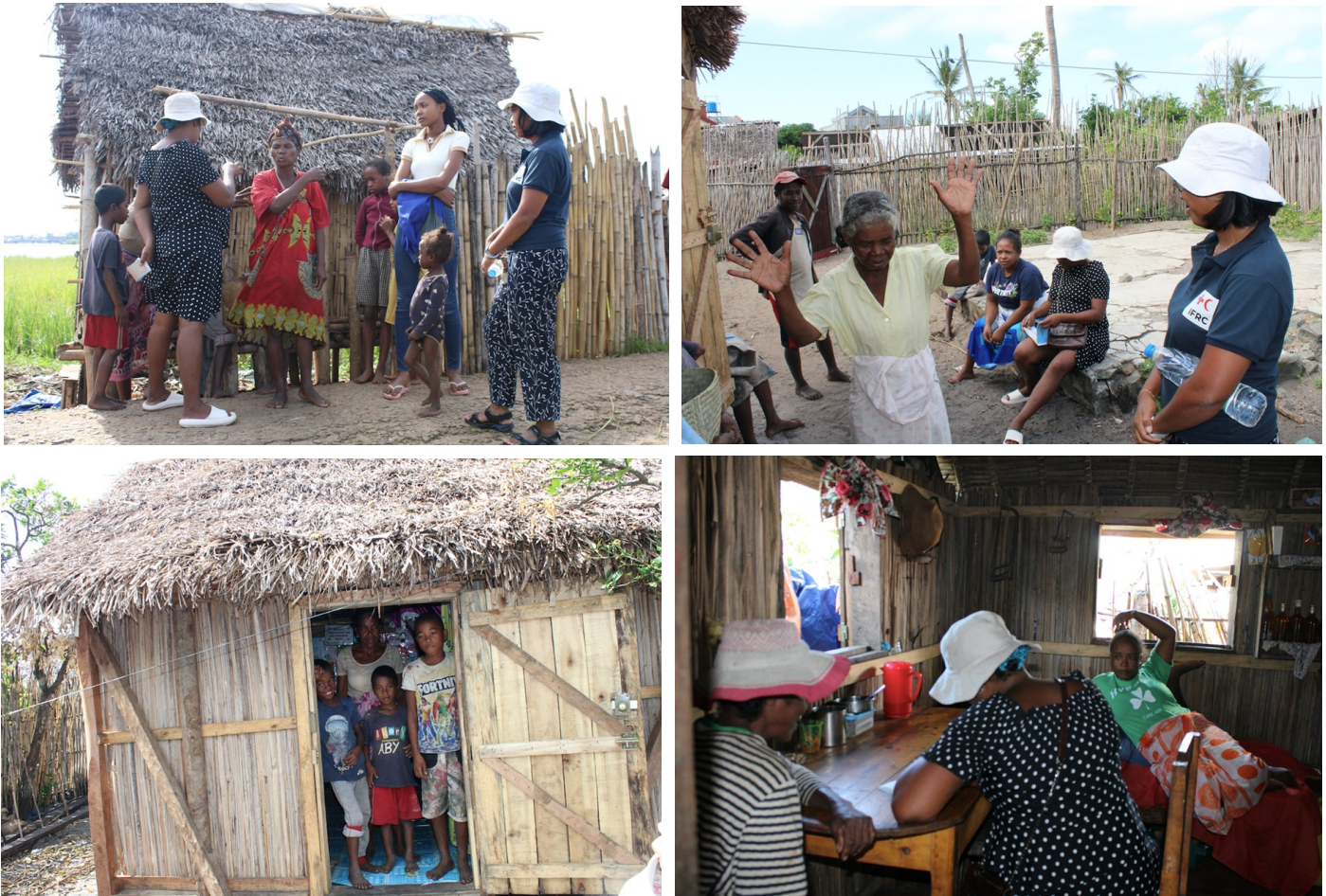
Pictures taken during the joint visit between IOM and IFRC in Mananjary .

The IOM team, in partnership with other humanitarian agencies, is continuing its efforts to improve the livelihoods of the most vulnerable households on the field in the South-eastern region of Madagascar.