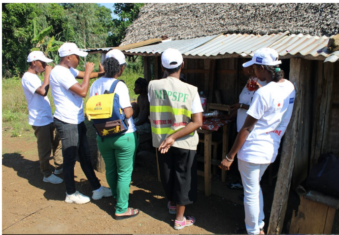
Pictures taken during the visit to prepare for the launch of the psychosocial support and social protection activity in the commune of Mangatsiotra on May 20.