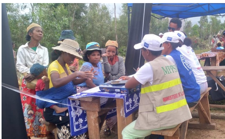
Pictures taken on May 24 th , during the meeting with the associations led by women from 5 fokontanys in the commune of Mangatsiotra, Fitovinany region.