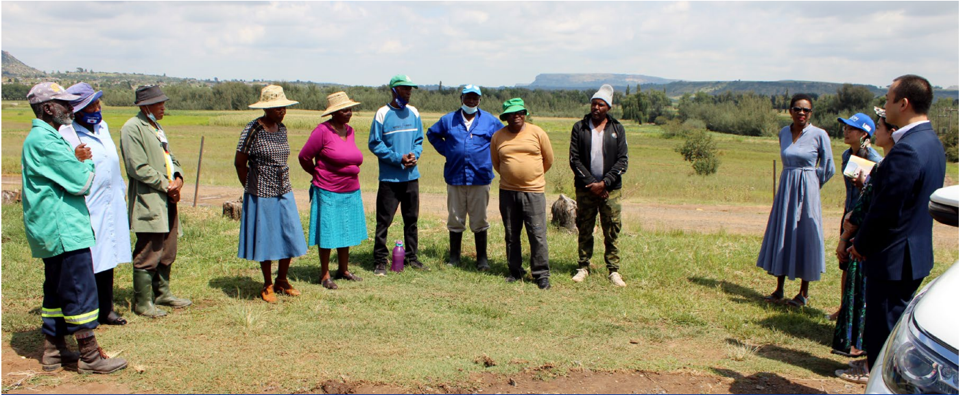
Japanese representatives and IOM meeting poultry project members at Ha-Leshoe in Leribe District

However, he said there are some challenges they are facing, “The main challenge we are facing is the shortage of clean water for the chickens as they need clean water. We buy water from WASCO which becomes expensive.” “Another big challenge is the security of this place, if we can find means of fence this area to make it more save.” Further, he said there is a need for training to improve their knowledge and skills on taking care of the chickens. Finally, he highlighted that their vision is to expand their project so that the community can provide support to other vulnerable people and orphans.