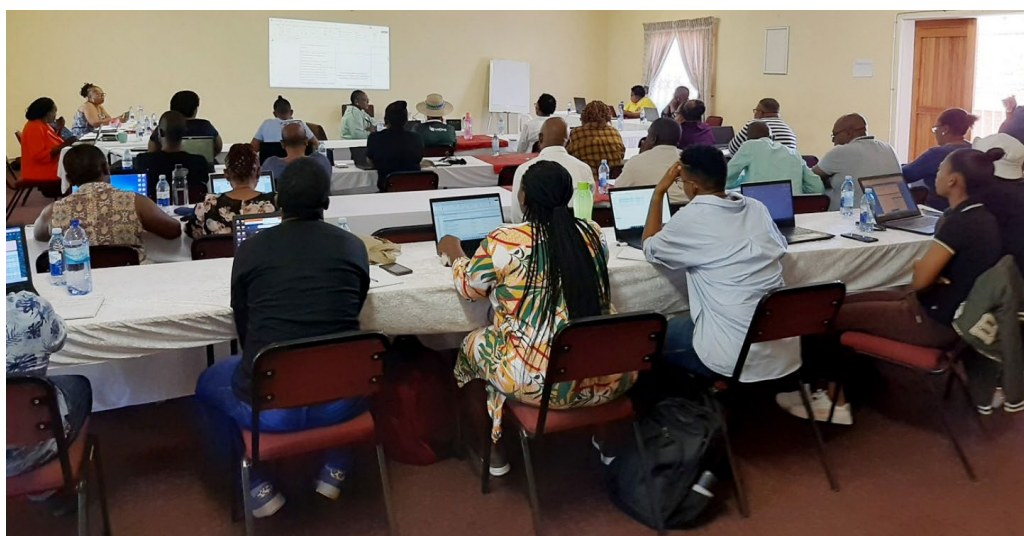
Participants of the Ministry of Health's Family Health Division Technical Working Group

at large. Stakeholders represented in this meeting included Family Health Division, Dietetics department, Health Planning and Statistics Department, HIV and AIDS department and IOM. This meeting was supported under the SRHR-HIV Knows No Borders project funded by the Kingdom of the Netherlands.