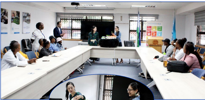
Japanese representatives and IOM meeting young returnees

On their way back, the delegation stopped by the Moshoeshoe I international airport to engage with border officials on border governance efforts including capacity development and the installation of CCTV which was also provided by the Government of Japan.