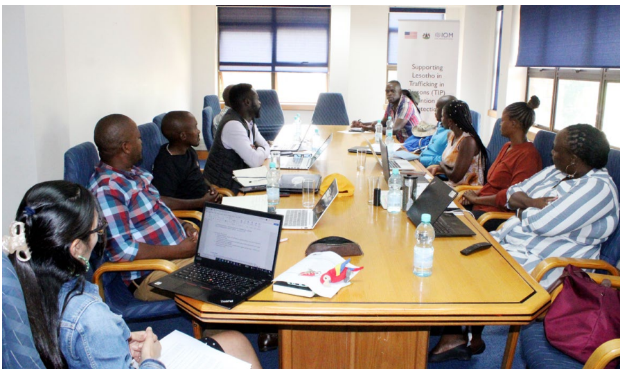
IOM and representatives from MWA, BDS, Skillshare and LMPS

On 7 February 2023, IOM organised a coordination meeting with Civil Society which plays a role in fighting against Trafficking in Person (TIP). The coordination among the various stakeholder is always a critical aspect to ensure there is no duplication of efforts while building the synergy among the NGOs actively involved in TIP program in Lesotho. Stakeholders represented in the meeting were Skillshare, Migrant Workers Association, Beautiful Dream Society (which also represent Love Justice) and the Lesotho Mounted Police Service with its Anti-Human Trafficking and Migrant Control Unit. In this meeting, they also discussed the upcoming activities plans presented by each stakeholder. Enhance coordination and cooperation among the TIP stakeholders is critical part. This meeting was supported by the United States Government under the project “Supporting Lesotho in Trafficking in Person Prevention and Protection.”