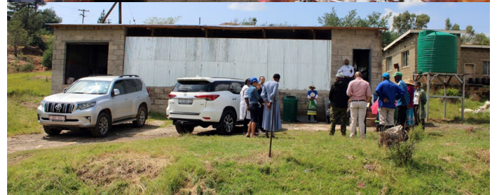
Japanese representatives and IOM visiting poultry project at Ha-Leshoe in Leribe District