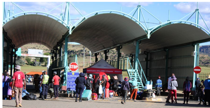
Returning migrants receiving health and border services at Tele border

During the 2022/2023 festive season, migrants who had valid passports, who had no passports and those whose passport had overstayed in South Africa came home in larger numbers through official borders following the announcement by the Government of Lesotho which encouraged the migrants to come home through official borders, having passport or not with the promise that those without passports will not be arrested for staying and working in South Africa with no proper documents at borders. This was done to give chance to Basotho nationals who had no passports to come home to make proper documents that will allow them to work in South Africa.