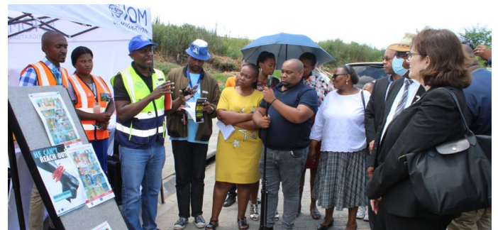
The delegation exploring the TIP sensitisation campaign site at Maseru border

IOM to address these issues and see how we can assist the good work that the Government of the Kingdom of Lesotho is already doing."