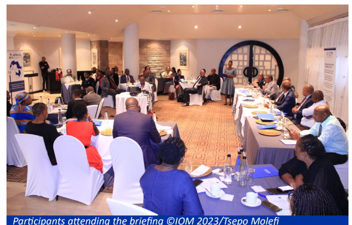
Participants attending the briefing

The high-level meeting brought together the Home Affairs, Labour, Foreign Affairs and Education Ministers, as well as Parliamentary Portfolio Chairpersons and Principal Secretaries. Reacting to IOM's presentation, the minister of Labour, Hon.