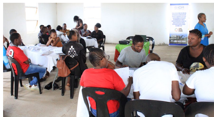
Adolescent, Youth & Migrants in financial training

young men and women of Leribe. The evidence of their learning from what I have seen is from their general knowledge, skills, attitude, and behaviour during the training process. They were able to actively participate and bring on discussion what they have been doing outside before this training, and my role was just to stimulate the discussion and make it more fruitful and give guidance.”