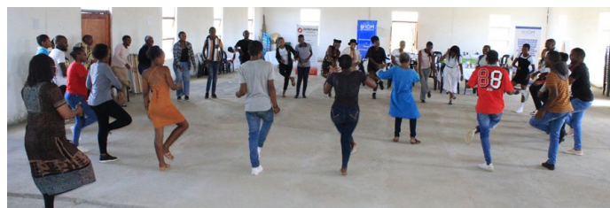
Refreshing time during financial literacy training

Upon their completion, 60 beneficiaries will start their skills training in May 2023, where they will acquire skills on different marketable trades that will help them build their resilience, improve their livelihood and establish their own businesses. This initiative is done under the SRHR-HIV Knows no Borders Project which supported by the Government of the Netherlands.