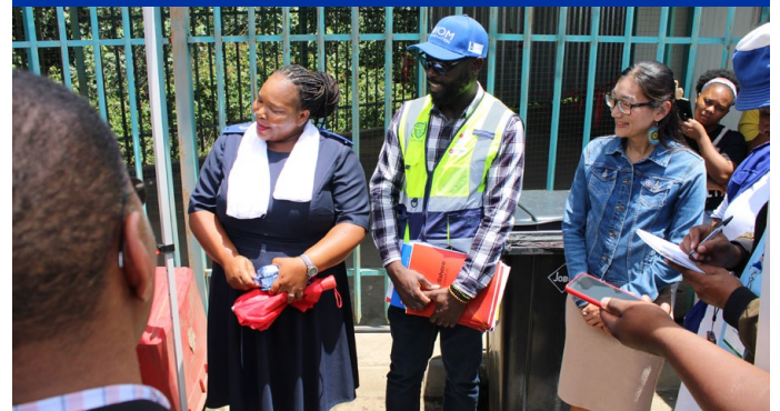
Health official explaining the friendly health services given to migrants at border