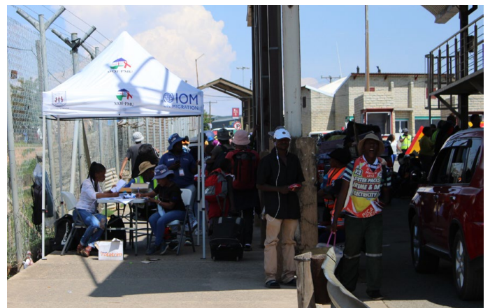
Returning Migrants waiting to receive services at Maputsoe Border

During the festive season in late December and early January 2023, International Organisation for Migration (IOM) team conducted monitoring visits at borders to witness the service delivery to the migrants and border communities. IOM is supporting the Ministry of Health and health partners to bring essential health services – such as HIV testing, TB screening and COVID-19 screening and vaccination, closer to labour migrants coming back home for Christmas holidays.