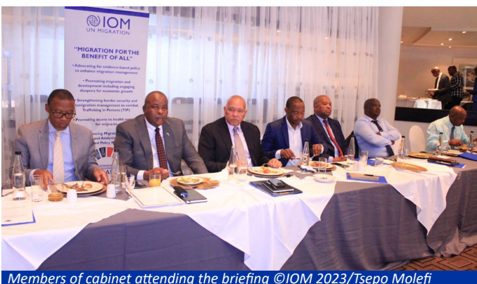
Members of cabinet attending the briefing

The meeting was supported by the United States Department of State, Bureau of Population, Refugees, and Migration (PRM)'s Office of International Migration (PIM)