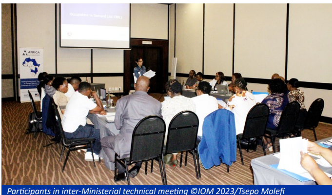
Participants in inter-Ministerial technical meeting

In conclusion, he urged the participants to be committed in this initiative as the first move the country has taken. This initiative is part of IOM's Africa Regional Migration Program (ARMP) activities, a programme implemented by IOM in Lesotho with financial support from the United States Department of State, Bureau of Population, Refugees, and Migration (PRM)'s Office of International Migration (PIM).