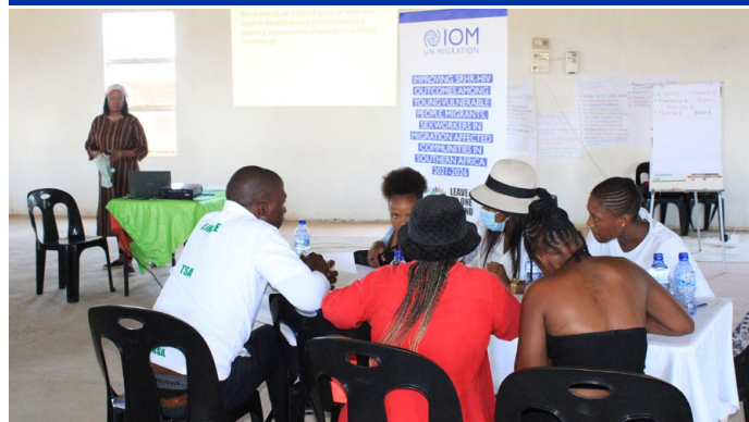
Group work - financial literacy training