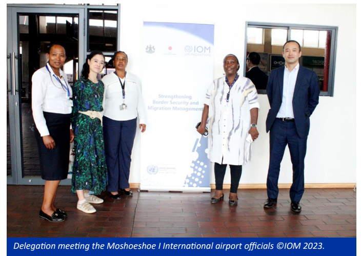
Delegation meeting the Moshoeshoe I International airport officials ©IOM 2023.

The delegation also met young returnees and other vulnerable youth who acquired recycling and cosmetics production skills from vocational training centres under the same Japan-funded