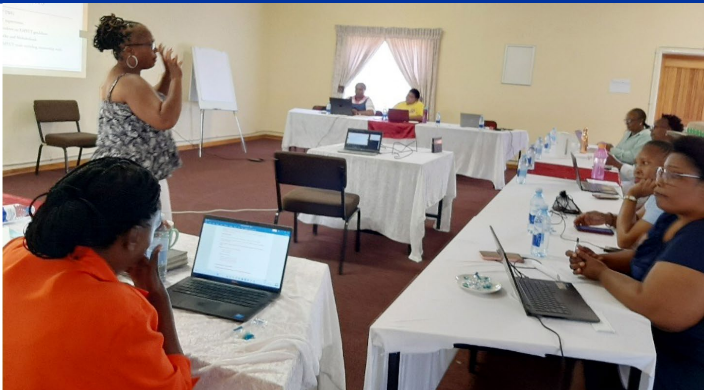
PMTCT Manager providing progress on the 2022 SRMNCAH-N plan

On 3-5 February 2023, IOM supported the meeting of the Ministry of Health's Family Health Division Technical Working Group focusing on Sexual, Reproductive, Maternal, New-born, Child, Adolescent Health and Nutrition (SRMNCAH-N) held in Teyateyaneng, Berea District. The purpose of the meeting was to review the achievements of the technical working group, and challenges during implementation of the 2022 work plan. The meeting brought together stakeholders in Maternal, adolescent health, child health and discussed issues that affect directly and indirectly the health outcomes of the mentioned target group.